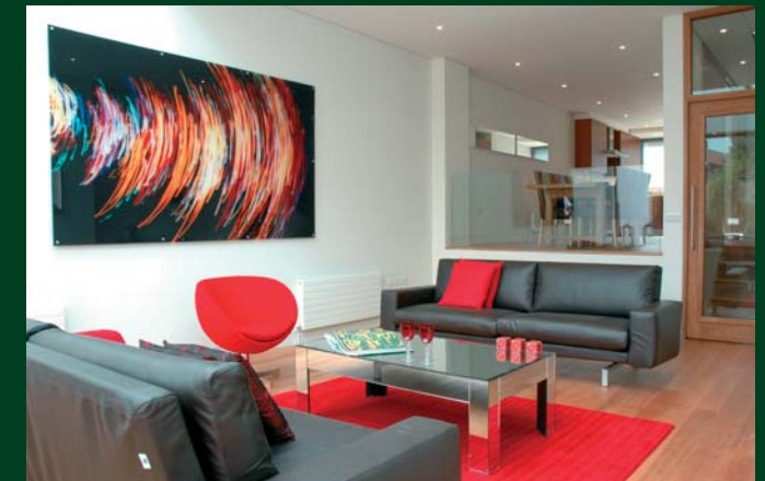
Vernon Street, Manchester, 24 unit residential scheme

Q Developments is seeking to expand its operations with joint venture partners and land owners, to build on the success achieved in recent years. We are flexible enough to purchase unconditionally, to joint venture as an equity partner, or take the role of development partner. Our depth of experience allows us to operate within multiple disciplines in a variety of locations. The strength of our brand and the hands-on nature of our operation are the foundations of our ability to Add Value.