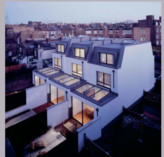
TONSLEY PLACE SW18

Q Developments has proven its strengths; to add significant value through planning to vacant Brownfield and Greenfield sites; to reconfigure and improve existing planning consents for greater development gain; to identify under-utilised or under-achieving assets and to build exciting, modern projects throughout London and across the country.