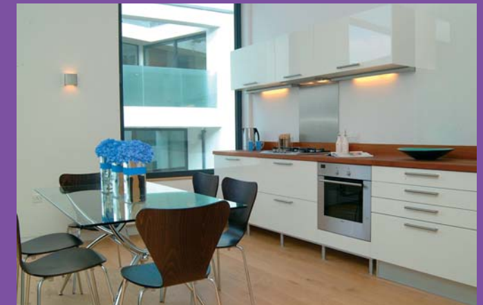
Mixed-use development in Ruislip, West London, residential & retail, £11m development

Our history of success has us in a position of strength to move quickly into any opportunity, and the specialist nature of our team means that we can assess project feasibility quickly through a sophisticated model, reflective of current market conditions and our extensive experience.