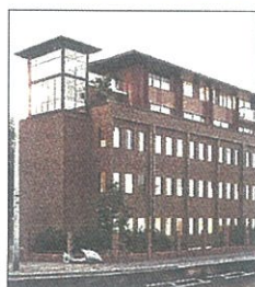
From £390,000: apartments at The Syon, right, opposite Syon Park, location of historic Syon House