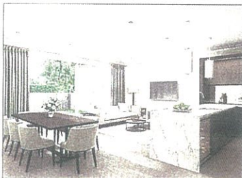
From £1,195,000: The Longfords in Teddington mixes traditional and contemporary design homes

An Edwardian chapel has been turned into triplex houses with open galleries and vaulted ceilings, while an original stable block is now mews cottages. The