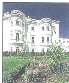
From £650,000: for flats at Fitzroy Gate in Isleworth, right, a former convent, with townhouses, left, from £1.25 million

a garden facing the landscaped grounds. It feels like a sanctuary. An ornamental lake with swans is part of new flood defences, and residents have fob access through gates to the upgraded Thames Path. This part of the river also sports a large, wooded island and a working boatyard. Heritage specialist Beechcroft has undertaken refurbishment of the old buildings and added tasteful contemporary interior design. Apartments start at £650,000. Secure parking has been created within the development. Call 020 3326 1233.