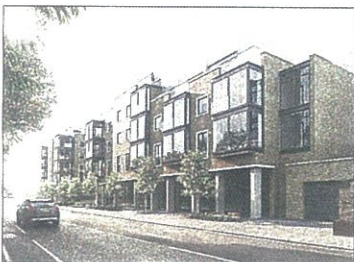
From £425,000: London Square Isleworth flats, left, are set around a communal garden square

London Square Isleworth is another new development, offering 162 flats