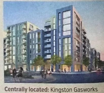
Centrally located: Kingston Gasworks