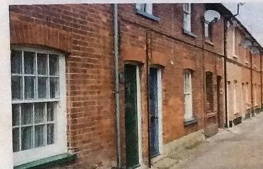
Traditional: Kingston's Victorian terrace houses

THERE are Victorian and Edwardian terraces and detached houses, riverside apartments and interwar semis. Kingston caters for everyone, from first-time buyers and landlords profiting from the buoyant student market to families from the town centre, which includes KT2, which covers North Kingston and the exclusive Coombe Hill Estate.