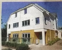
New-build scheme: 219 Park Road

On a more modest scale, 16 one and two-bed flats launch later this month in Barton House through Jackson-Stops & Staff. Next spring sees the launch of apartments and penthouses at centrally located Kingston Gasworks, from Berkeley Homes. And St George is proposing to redevelop the Old Post Office site, creating 360 new homes.