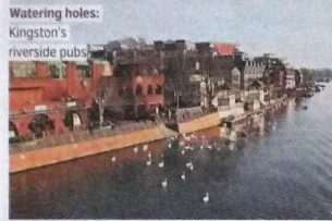
Watering holes: Kingston's riverside pubs