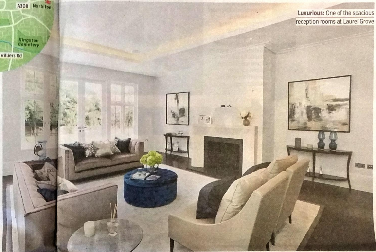
Luxurious: One of the spacious reception rooms at Laurel Grove